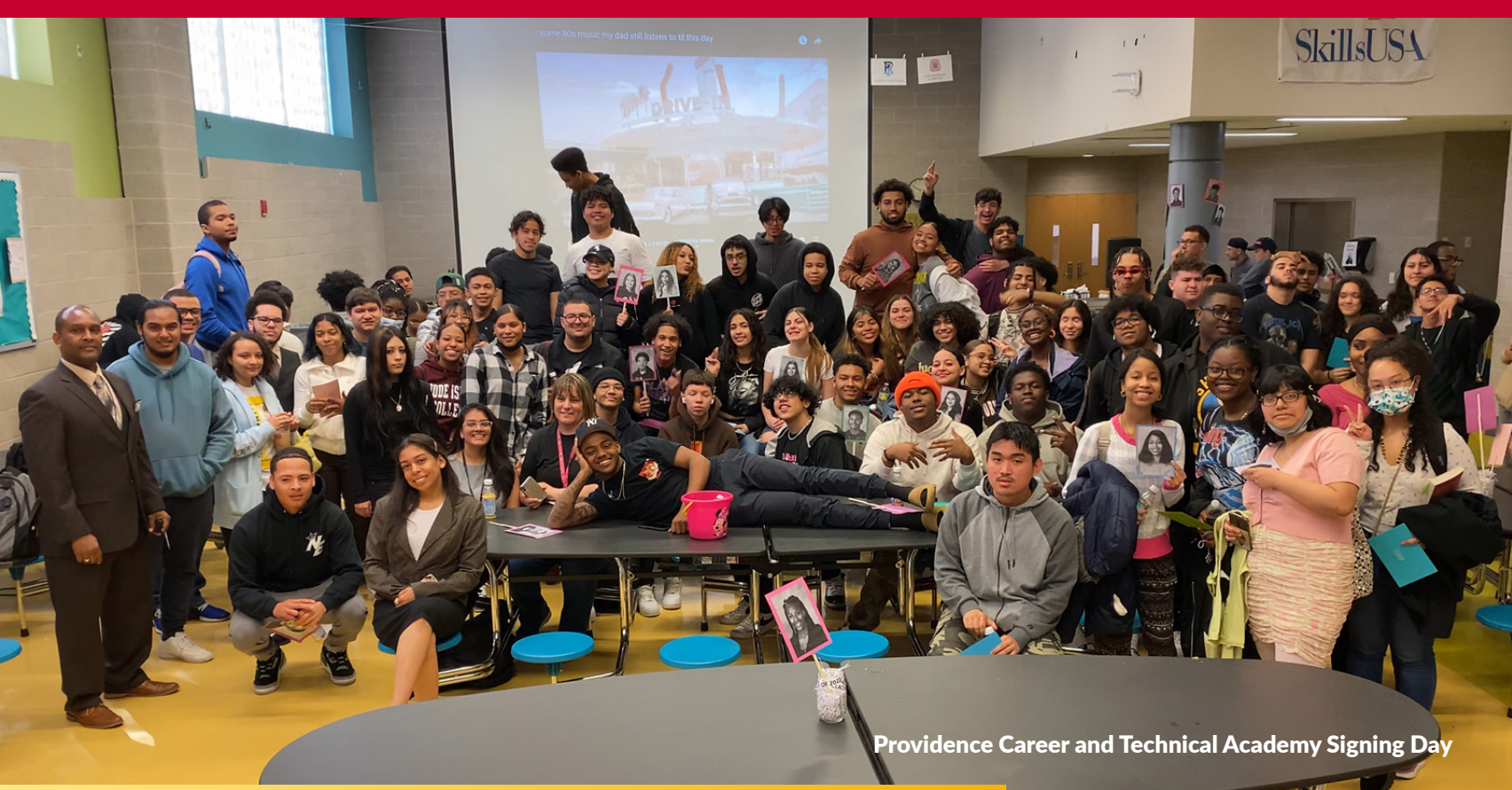
Providence Career and Technical Academy Signing Day